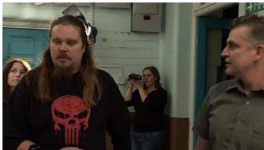
Being shown around Crowley Hall