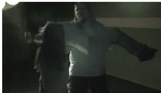
Problems at Crowley Hall