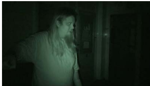
Night vision Vigils