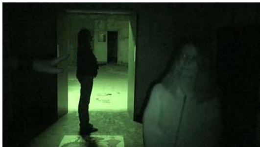
Investigating the Children's Ward